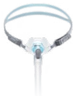
F&P Brevida™ Nasal Pillows Mask