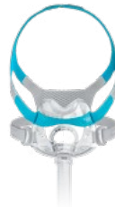
F&P Evora™ Full Compact Full-Face Mask