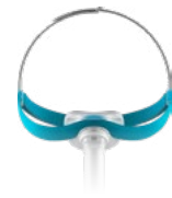
F&P Evora Nasal Compact Nasal Mask