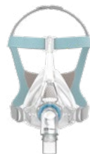
F&P Vitera™ Full-Face Mask