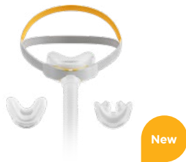
F&P Solo™ AutoFit™ Nasal Mask AutoFit Nasal Pillows Mask†