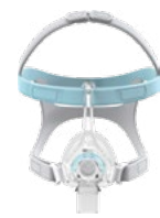
F&P Eson™ 2 Nasal Mask

Prescription only. Use only as directed. Always follow the instructions for use. Your healthcare professional will advise you whether this product is suitable for you/your condition.